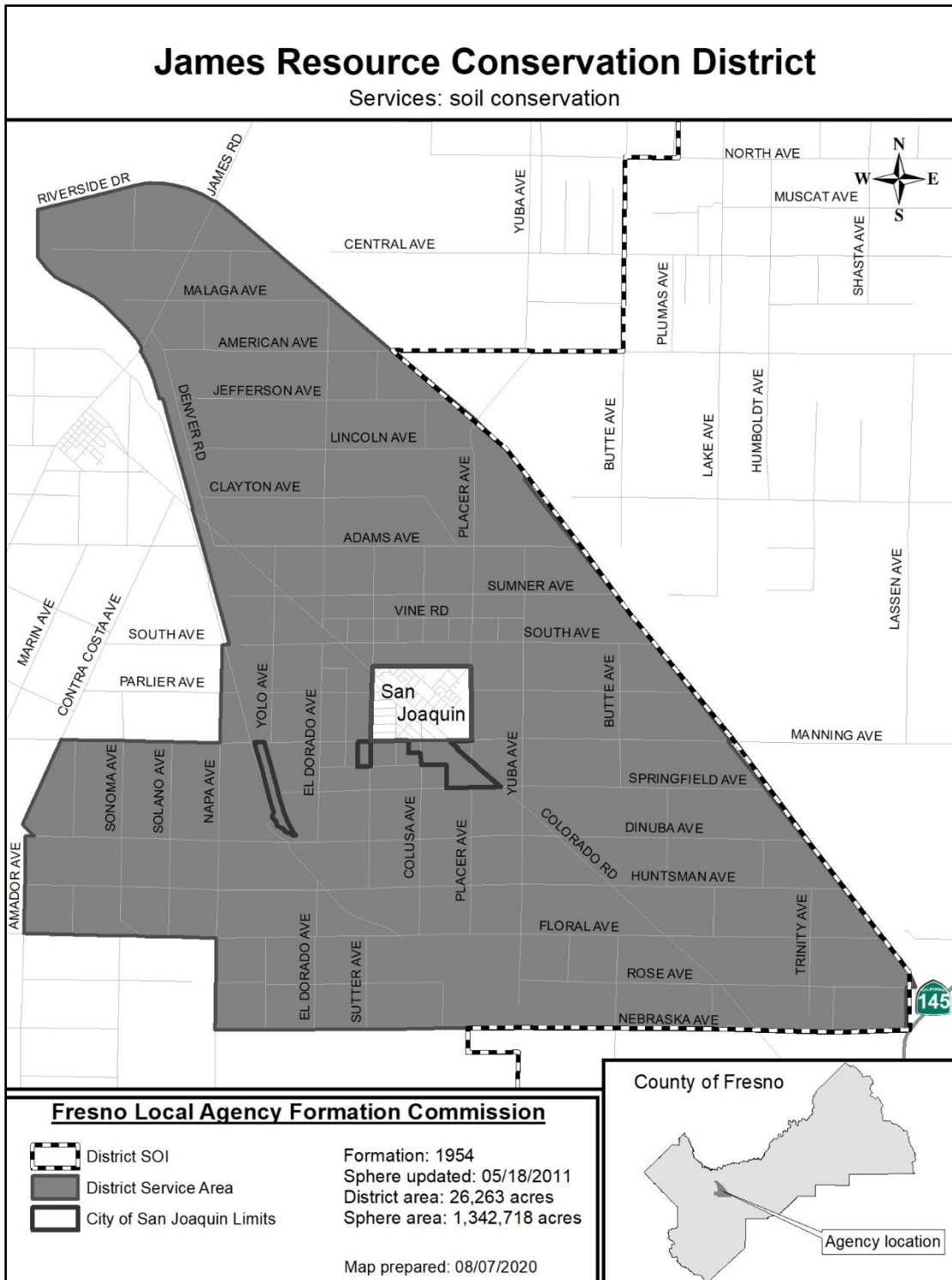
Figure 1 - James Resource Conservation District Map