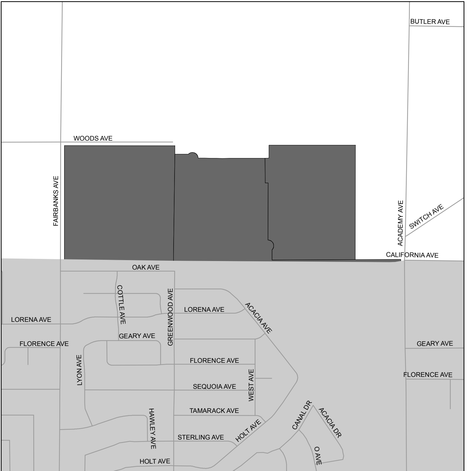
City of Sanger "California-Academy Northwest Reorganization" LAFCo File No. RO-07-21